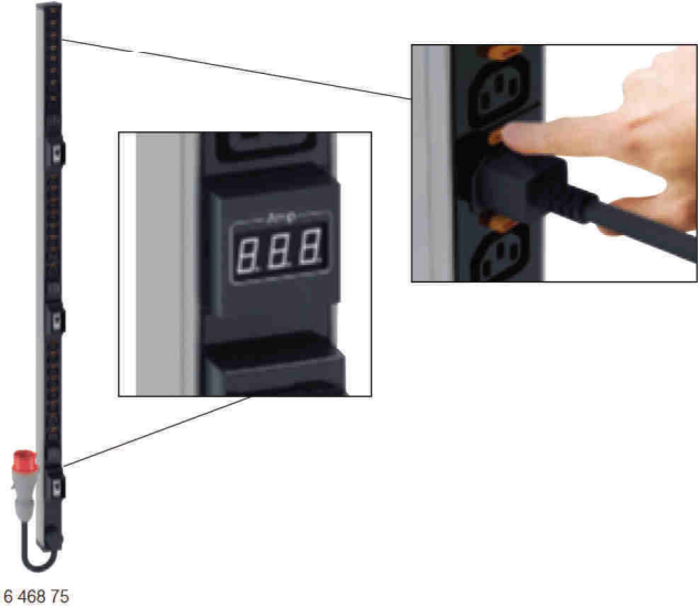
Technical characteristics p. 17-19

To provide ~ electric power for IT equipments in 19" enclosures Three phase 380 V - 50/60 Hz power supply Zero-U PDU for vertical mounting in the cabinet (see p. 18-19 for dimensions) Each circuit is protected by 16 A single pole MCB in a support with projecting edges to avoid accidental breakdown 1 circuit per phase, each with 6 IEC 60320 C13 outlets and 2 IEC 60320 C19 outlets 330° rotating cable input for a perfect orientation of the cable and no interference in the cabinet C13 and C19 standard outlets are equipped with cord locking system to avoid any accidental disconnection. Universal solution compatible with all the cords (C14 plugs for C13 and C20 plugs for C19) Delivered with 2 sets of metallic mounting brackets: - Button brackets. For quick fixing and variable pitch - Standard brackets. For screw fixing Black modules (outlets and functions) Aluminium profile